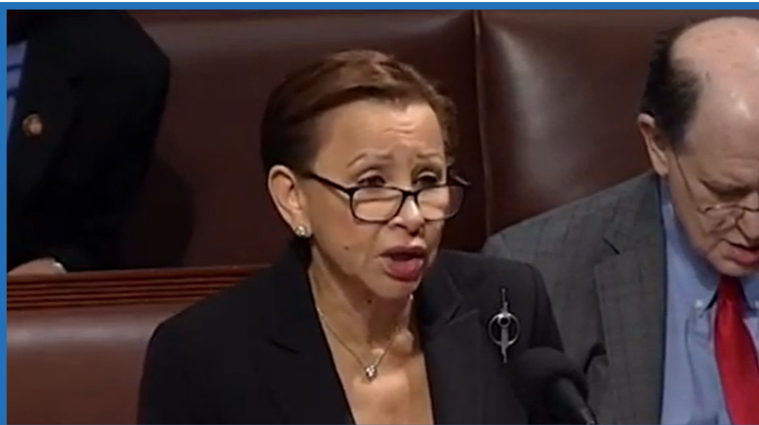
CHAIRWOMAN VELÁZQUEZ'S SPEECH IN SUPPORT OF THE CARES ACT

The bipartisan bill featured numerous provisions for small business relief. The CARES Act created the Paycheck Protection Program (PPP), a small business debt relief program, opened up the Economic Injury Disaster Loan program for COVID-19, and created emergency grants through the EIDL program. These programs allocated 100's of billions to small businesses through low-interest loans and grants and helped hundreds of thousands of small businesses keep their doors open.