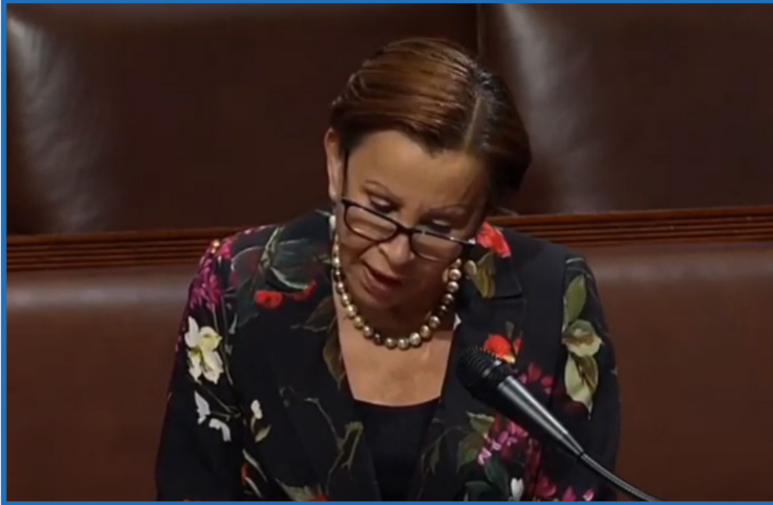
CHAIRWOMAN VELÁZQUEZ'S SPEECH IN SUPPORT OF HEROES ACT

The bill appropriates $3 trillion in new funds to help the country combat the pandemic. The bill features small business provisions that would allocated $10 billion in EIDL grants, make improvements to PPP, and implement similar reforms to SBA's flagship lending programs as were taken in the aftermath of the Great Recession. The bill has yet to be taken up by the Senate.